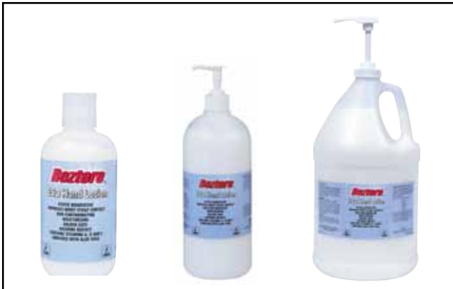
Figure 1. Reztore™ ESD Hand Lotion.