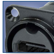
D-shape metal housing