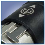
Push Pull locking