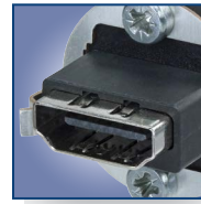
HDMI 1.4 receptacle