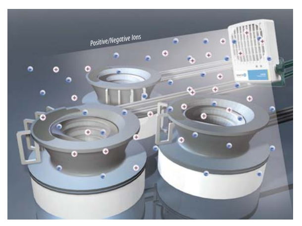
minION2 ionization for bowl feeder application.