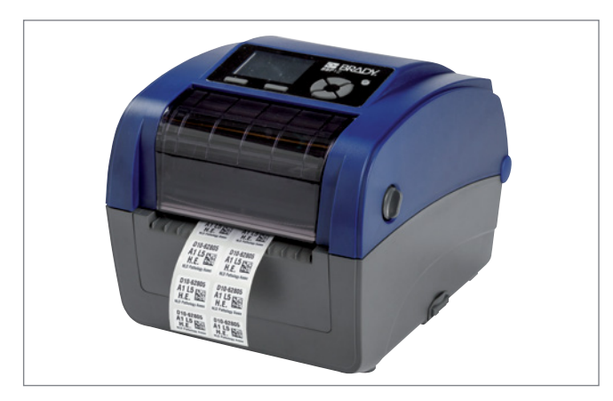
Step 3: Print