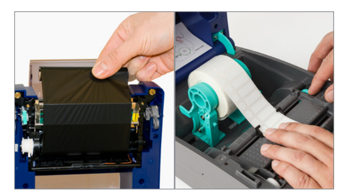
Step 1: Insert media