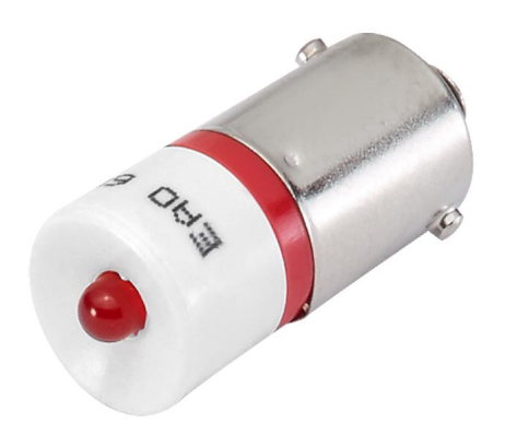
Attention: The preview is based on a sample product. This can differ from your current configuration.