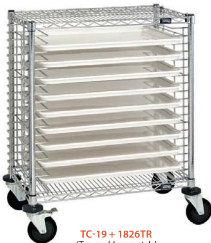
TC-19 + 1826TR (Trays sold separately)