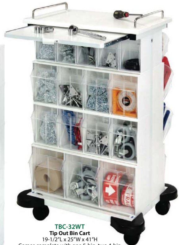
TBC-32WT Tip Out Bin Cart