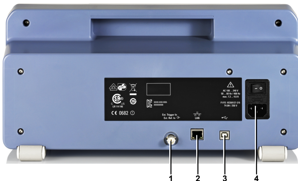
Figure 4-2: Rear panel of the R&S FPC