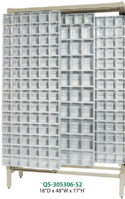
QS-305306-52 18"D x 48"W x 77"H

This system features four individual panels filled with tip out bins. Two are fixed to the back side of the system and two slide easily from left to right allowing free access to all four panels. Manufactured of tough 14 gauge steel with a baked enamel finish, the overall unit measures 18"D x 48"W x 77"H. (96" widths and 26" depths are available via special order). Bins are available in 3 exterior colors.