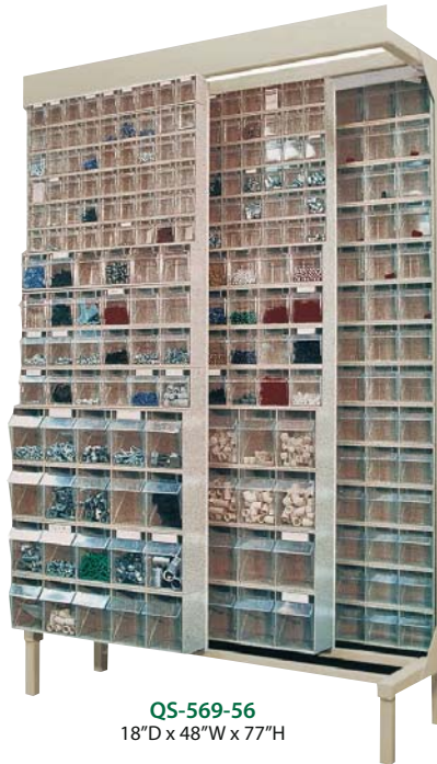
QS-569-56 18"D x 48"W x 77"H