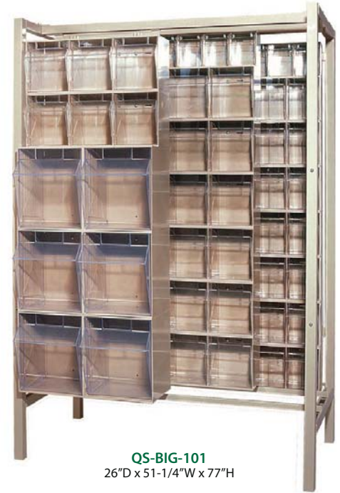
QS-BIG-101 26"D x 51-1/4"W x 77"H