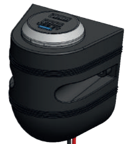
Do not install USB chargers facing upwards