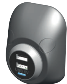
PVPro USB with P/N: USB-WPOD vertical mounting pod