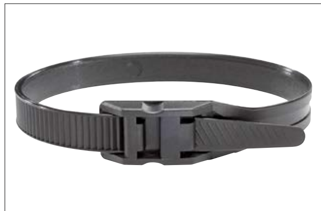
Low profile cable tie, LPH-Series.