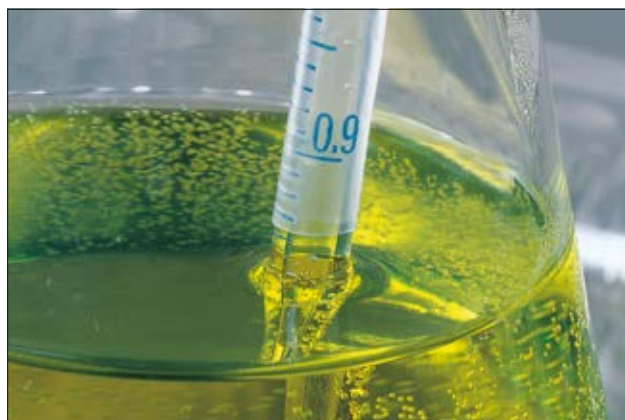
This thin walled, translucent heat shrink tubing is often used for chemical applications.