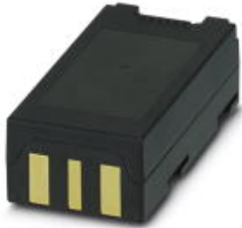
Rechargeable battery for operating the THERMOFOX printer

Please be informed that the data shown in this PDF Document is generated from our Online Catalog. Please find the complete data in the user's documentation. Our General Terms of Use for Downloads are valid ( http://phoenixcontact.com/download )