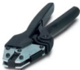
Crimping pliers, for CK 4,0... contacts, for 4.0 - 6.0 mm 2 conductor cross sections

Please be informed that the data shown in this PDF Document is generated from our Online Catalog. Please find the complete data in the user's documentation. Our General Terms of Use for Downloads are valid ( http://phoenixcontact.com/download )