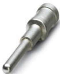
Turned 2.5 crimp contact, individual male contact, core diameter 2.5 mm 2 , silver-plated

Please be informed that the data shown in this PDF Document is generated from our Online Catalog. Please find the complete data in the user's documentation. Our General Terms of Use for Downloads are valid ( http://phoenixcontact.com/download )