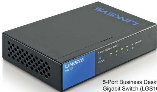
5-Port Business Desktop Gigabit Switch (LGS105)