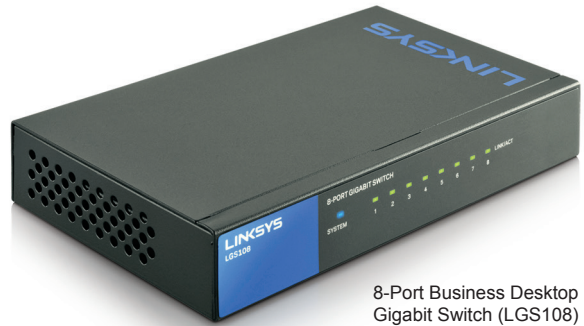
8-Port Business Desktop Gigabit Switch (LGS108)