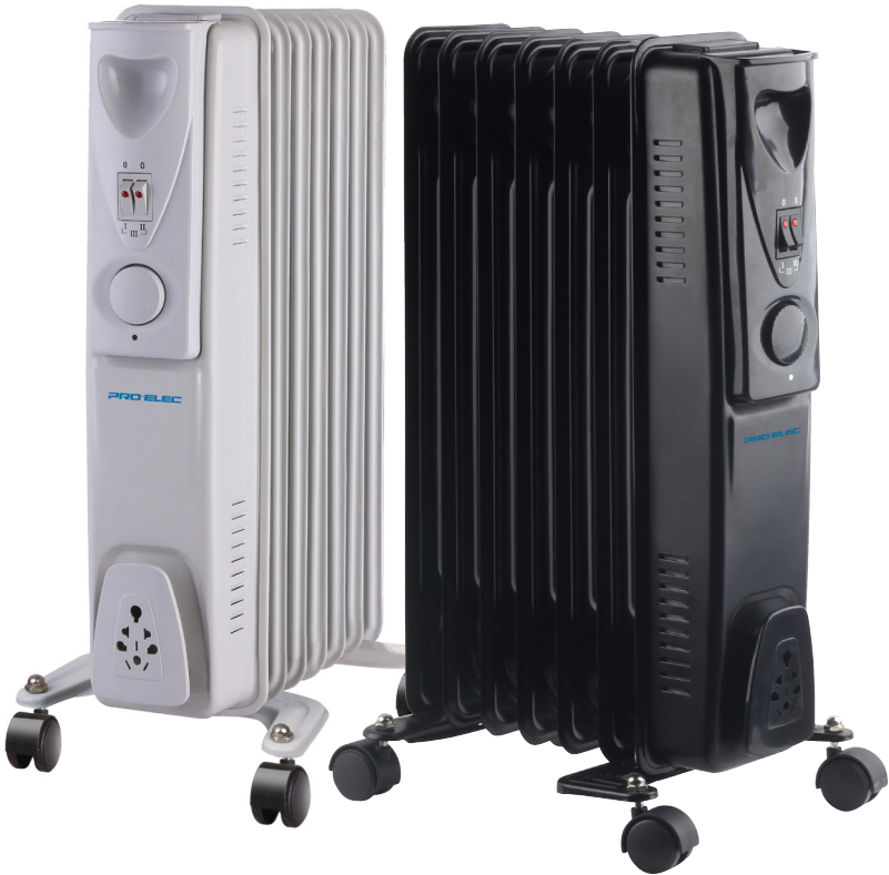
1500W 7 FIN OIL FILLED HEATER Model: PEL00915 and PEL00916