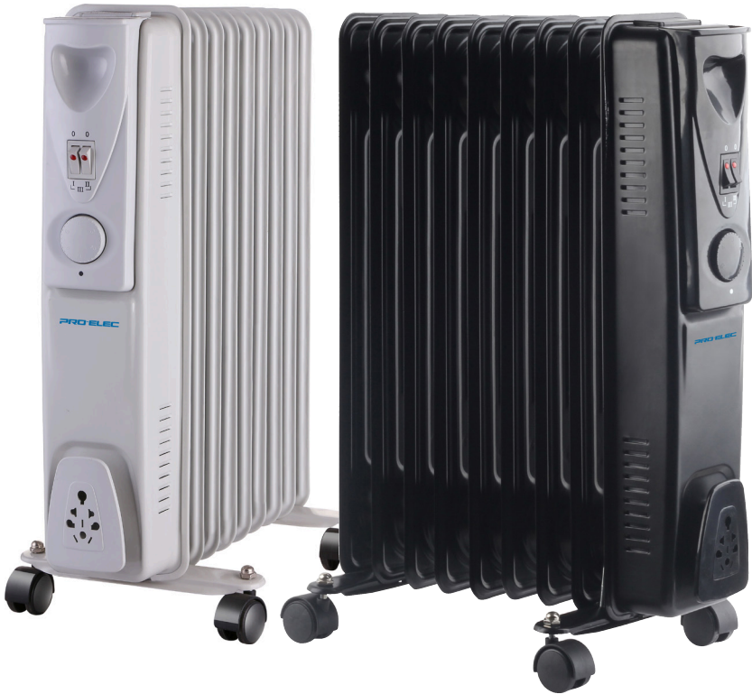
2000W 9 FIN OIL FILLED HEATER Model: PEL00917 and PEL00918