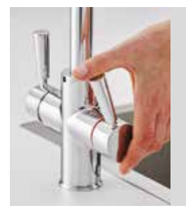
Safety interlock operation and insulated spout for piece of mind