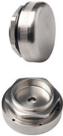
Photo: Inside view