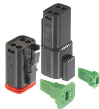
4-Circuit ML-XT System