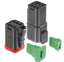
6-Circuit ML-XT System