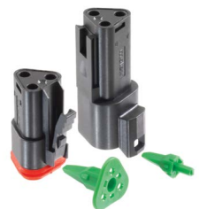
3-Circuit ML-XT System