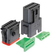
12-Circuit ML-XT System