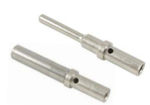
Solid Contact Terminals