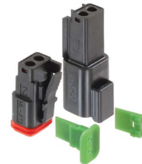
2-Circuit ML-XT System