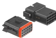
18-Circuit ML-XT System