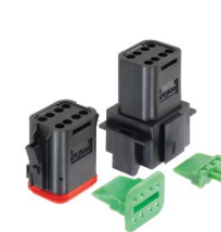
8-Circuit ML-XT System