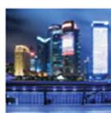
Lighting & Sense Control