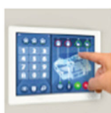
Climate & Sense Control