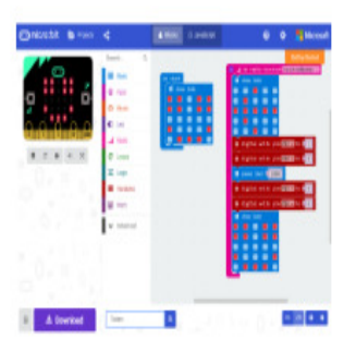
Bring it to life with the BBC micro:bit & code