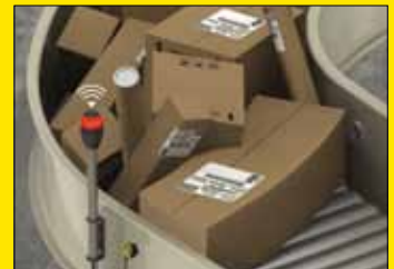
Manufacturing Line Blockage Indication A red, audible domed light alerts operators of congestion due to a box pile up.