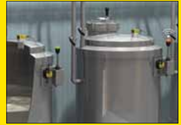
Tank Level Monitoring Status Indication K50L audible lights visibly and audibly alert operators when tank is filled to a certain point to prevent overflow.