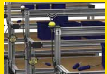
Product Line Status Indication Bright domed lights indicate the status of the workstations by alerting operators when products are complete.