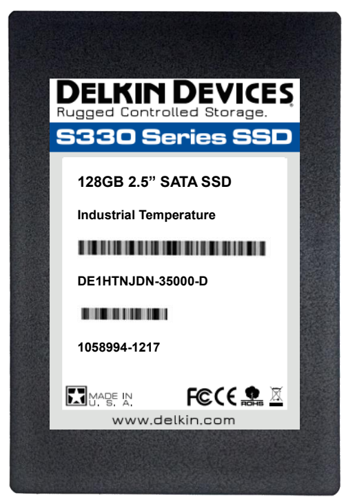
© 2017 | Delkin Devices Inc.