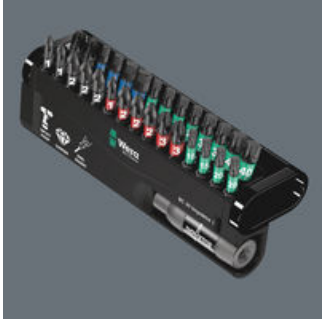
The Bit-Checks can be positioned upright at the workplace so the tool is always quickly to hand.