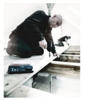
Impaktor technology for an aboveaverage service life even under extreme demands