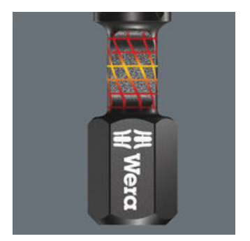
Torsion zone specially designed to absorb such forces and thereby protect the bit tip.