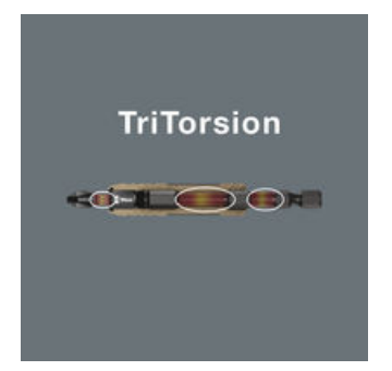
The combination of the double torsion zones in the Impaktor holder and the torsion zone in the Impaktor bit result in the so-called TriTorsion system.