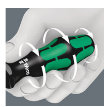
The hard materials used for the handle ensure rapid hand repositioning without any danger of the skin "sticking" to the handle. The surrounding hard zones with large diameters glide like wheels across the hand.