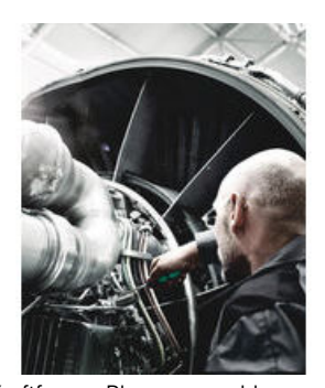
Kraftform Plus screwdrivers – ergonomics you can grasp. They relieve the entire hand-arm system even when used intensively. Along with other technical and product advantages such as the Lasertip for a secure fit in the screw head, Kraftform screwdrivers are the ideal choice whenever manual screwdriving jobs are concerned.