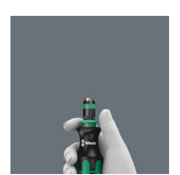
When the unique telescopic blade is lowered into the handle, fast, easy screw-driving action is possible, even in the tightest spots!