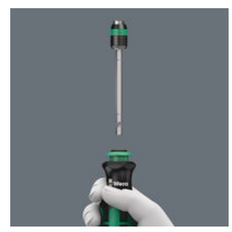
If the clamping sleeve is pushed again the telescopic blade can be taken out of the handle, and be used as a machine bit adaptor.