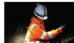
NON-SLIP SILICONE HEADBANDS