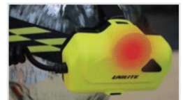
RED REAR BATTERY PACK LIGHT