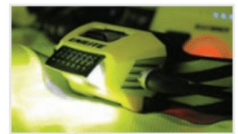
ANTI-DAZZLE LIGHT SHIELD