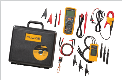
MDT Advanced Motor and Drive Troubleshooting Kit