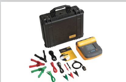
Fluke 1550C Insulation Resistance Tester Kit