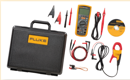
Fluke 1587 FC ET Advanced Electrical Troubleshooting Kit