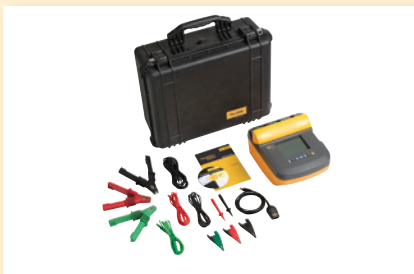
Fluke 1555 Insulation Resistance Tester Kit