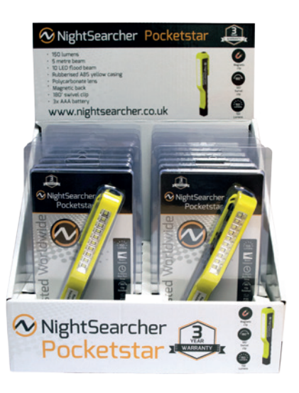
Point of sale carton display packs available showcasing 12x Pocketstar flashlights