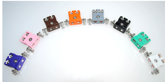
'IEC Colour coded'