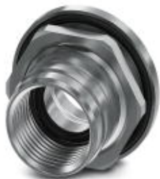
Housing screw connection, Socket, M12-Push-Pull, Rear mounting, THR- und Wellenlötkontakte

Please be informed that the data shown in this PDF Document is generated from our Online Catalog. Please find the complete data in the user's documentation. Our General Terms of Use for Downloads are valid ( http://phoenixcontact.com/download )