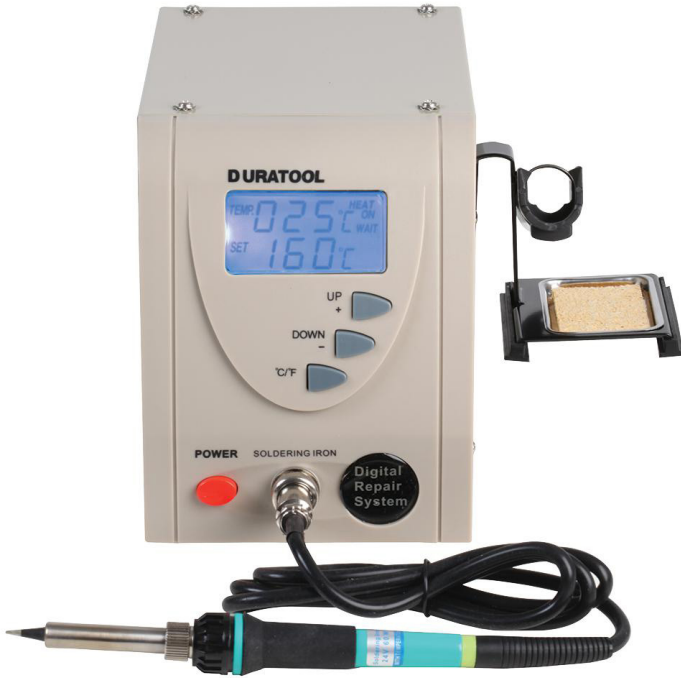
Model: SD01385 60W Digital Soldering Station