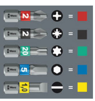
"Take it easy" tool finder with colour coding according to profiles and size stamp – for simple and rapid accessing of the required tool.