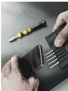
In a practical pouch