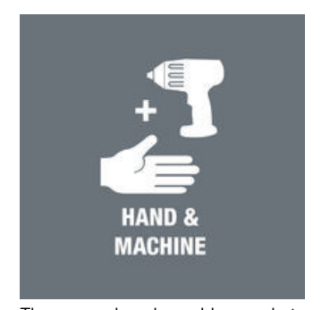
The manual and machine sockets can be used both for hand and power tools use (non-impact). Users need just one socket set for all applications.