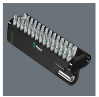
The Bit-Checks can be positioned upright at the workplace so the tool is always quickly to hand.

Universal holder with stainless steel sleeve