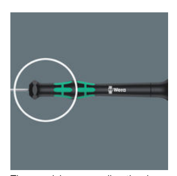
The precision zone directly above the blade gives the user a better feel for the right rotation angle during fine adjustment work.