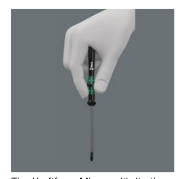
The Kraftform Micro, with its three zones and their specific arrangement, satisfies these requirements perfectly. The free-turning cap that provides support for the hand works with these advantages, enabling quick and easy precision work.