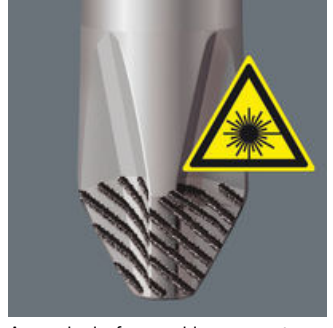
A precisely-focused laser creates a sharp-edged surface structure. This laser treatment results in an edge hardness of up to 1000 HV 0.3. Wera Lasertip "bites" itself into the screw head and prevents any slips out of the recess. It is available for screwdrivers for slotted, Phillips and Pozidriv screws.