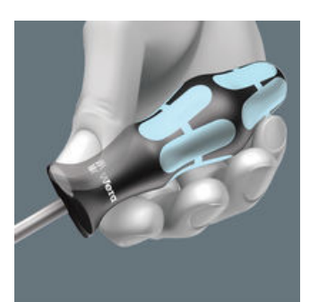
The outstanding design of the Kraftform handle that fits perfectly into the hand prevents hand injuries such as blisters and calluses.

The basic idea for the prototype of the Kraftform handle - that the hand should dictate the design has, right through to today, proved to be correct. In cooperation with the internationally recognised Fraunhofer IAO Institute, Wera developed a screwdriver handle designed to match the shape of the human hand as long ago as the 1960s. After a long development phase, the Wera Kraftform handle was launched to the market in 1968. It has been optimised through the years with new technologies, but has kept its proven shape. After all, the human hand has not changed either.