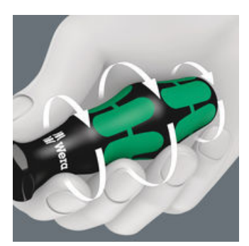
The hard materials used for the handle ensure rapid hand repositioning without any danger of the skin "sticking" to the handle. The surrounding hard zones with large diameters glide like wheels across the hand.

Further versions in this product family: