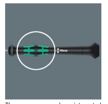
The power zone has integrated soft zones near the blade tip to ensure high torque transfer for loosening or tightening screws without losing contact with the screw.