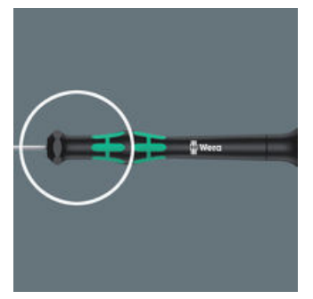
The precision zone directly above the blade gives the user a better feel for the right rotation angle during fine adjustment work.