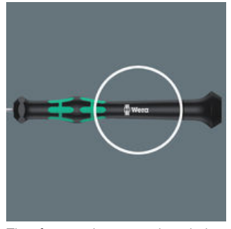
The fast-turning zone just below the rotating cap allows rapid twisting.