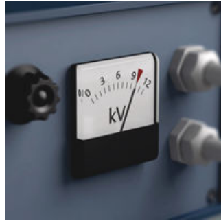
The individual testing of the Zyklop VDE tools at 10,000 volts, in accordance with IEC 60900, guarantees safe working under voltages up to 1,000 volts.