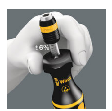
Measurement accuracy is \pm 6 % in accordance with the standard DIN EN ISO 6789. Distinctly audible and noticeable excess-load signal when the pre-set torque is reached.