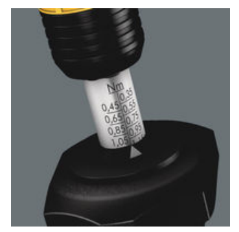
Easy-to-read scale value.