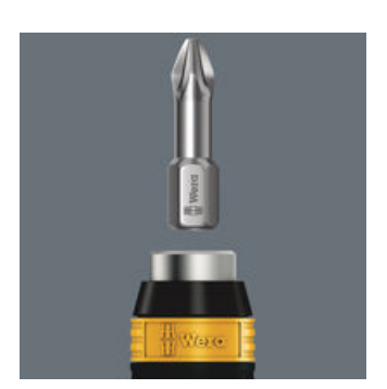
Rapidaptor technology makes the tool adaptable since bits and sockets can be exchanged rapidly.