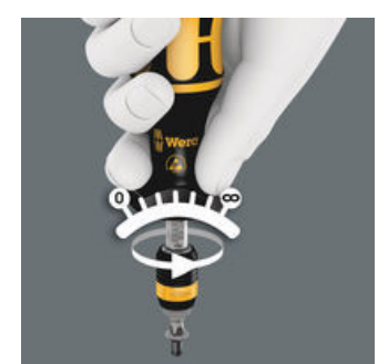
Unlimited torque for loosening seized screws.