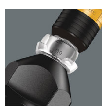
Articles 7430, 7431 and 7432 all come with a magnifying glass. This can be easily attached on to the scale, dramatically improving visibility.