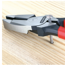
Gripping zone below the joint for powerful leverage