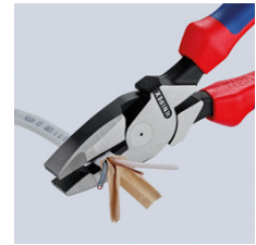
Long cutting edges for cutting flat cables