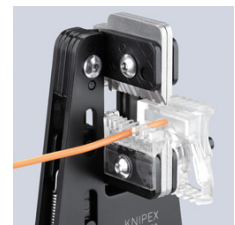
12 12 02 with cable guide and length stop