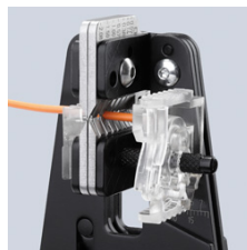
Precise cutting of the insulation to a complete extent