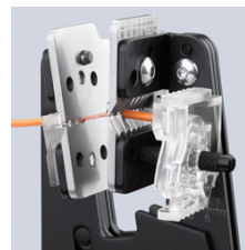
Positive stripping thanks to precise shape of the blades