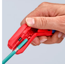
Stripping of a data cable