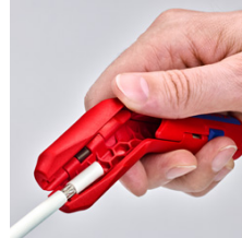
stripping of a coax cable