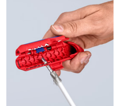
Stripping of a coax cable