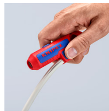
With concealed cutter in overhanging thumb rest on the side for convenient lengthwise cut