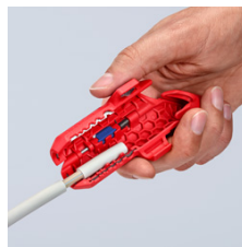
Stripping of a NYM cable