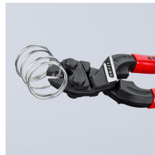
Powerful through to the tips