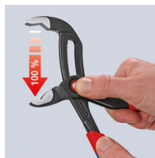
Press the button – open pliers completely