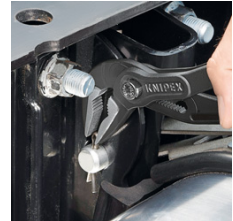
Optimum access to the workpiece. Ideal for service, maintenance and equipment repair, in automotive and general industry