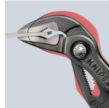
Very slim design in the complete head and joint area (compared to conventional water pump pliers)