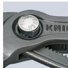
Fine adjustment by pushing a button: fast and comfortable.